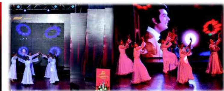
Glimpses of the evening